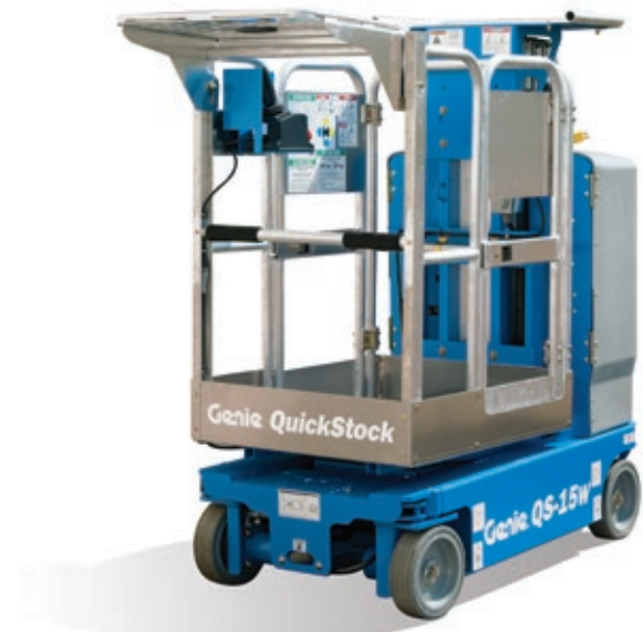
* Warehouse models only ** Not available with inverter