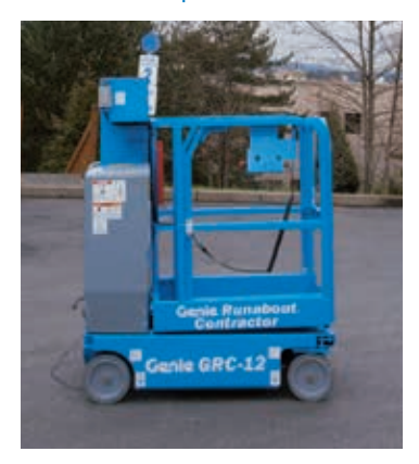
GRC™ Rigid Steel Platform Strong steel platform with standard extension deck offers an extra 16 in outreach.