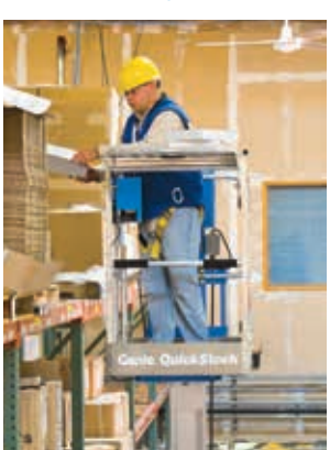
Stock Picker<sup>™</sup> Platform 35 x 28.5 in (89 x 75 cm) Offers dual side entry gates and front-folding tray.