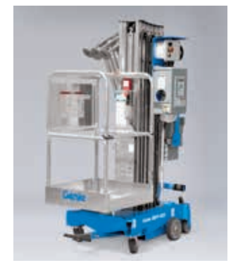
Standard Platform With Sliding Midrail 27 x 26 in (69 x 66 cm) An excellent general-purpose platform.