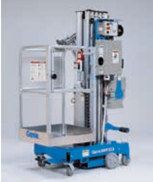
Gated Standard Platform 27 x 26 in (69 x 66 cm) Provides "step in" entry.