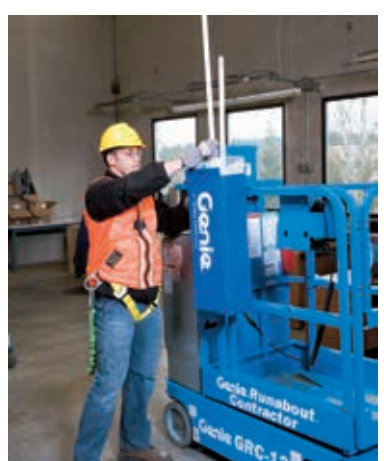
Fluorescent Tube Caddy (only available on narrow or standard platform)