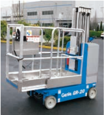
Sliding Mid Rail Extension Deck Platform 55 x 29.5 in (140 x 75 cm) provides 20 in (51 cm) of horizontal outreach and a larger work area within the platform.