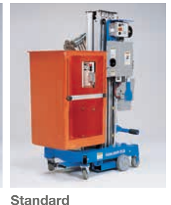
Fiberglass Platform* 29 x 26.5 in (74 x 67 cm) A general-purpose fiberglass platform designed for containing tools and materials.