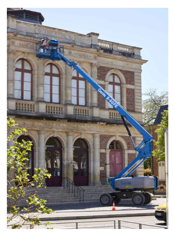
Low Noise, Low Emissions