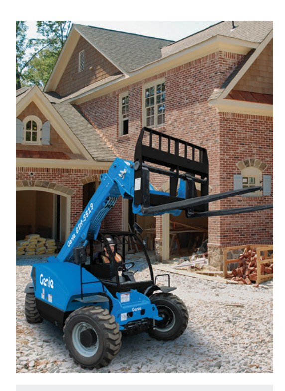
Material Handling Attachments