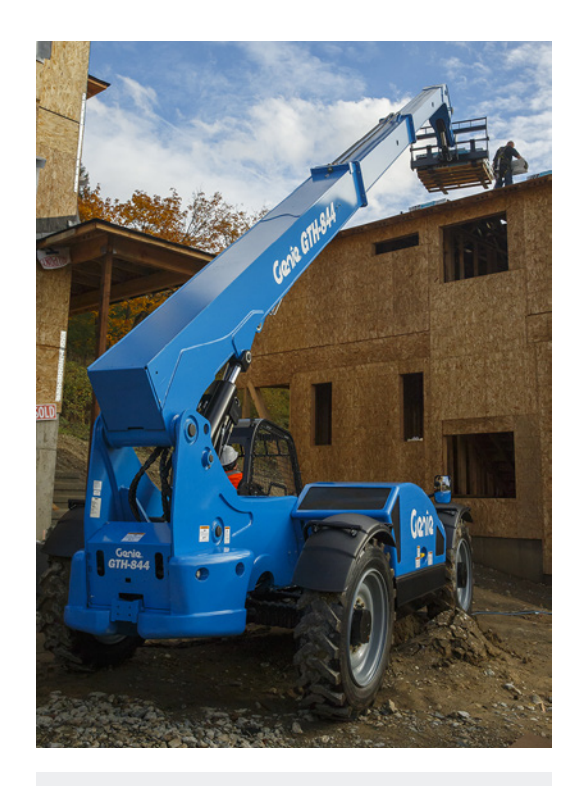
Long Life Tires