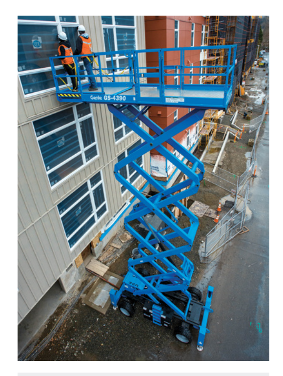
Slide-Out Engine Tray