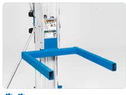
CO Standard Forks

Accommodate various loads for versatile lifting. Get an additional 21 in (53 cm) of lift by turning over and re-pinning the forks.