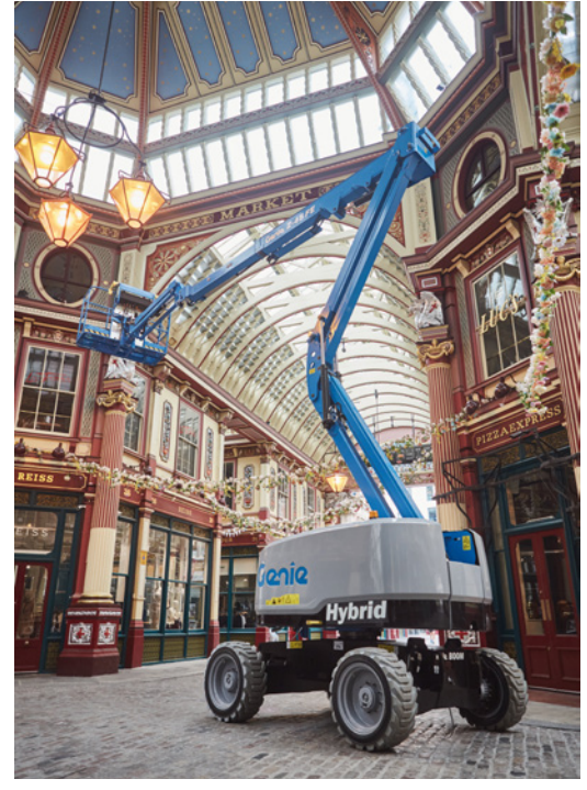
Rugged Terrainability 660lb/300kg Capacity Jib