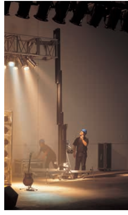
Quick, Simple Setup

The compact stowed position makes the Super Tower lift easy to move through doors and load on trucks with no bulky base to get in the way. Stowed dimensions are 22 in (56 cm) by 25.25 in (64 cm).