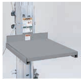
LOAD PLATFORM fits over the forks to handle odd-sized or heavy objects — no tools required for installation.