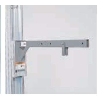
BOOM OPTION transforms your lift into a mobile, vertical crane or hoist to position tooling fixtures, circuit breakers, engines and more.