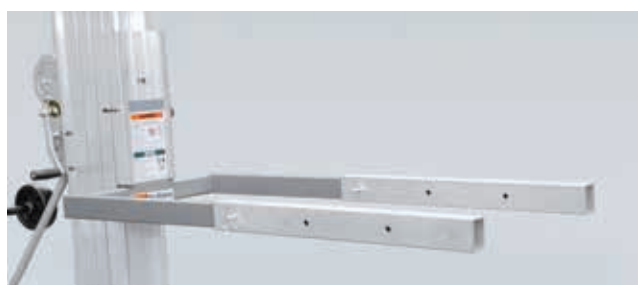
FORK EXTENSIONS insert onto standard forks for an additional 25 in (64 cm) of length.