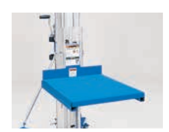
LOAD PLATFORM fits over the forks to handle odd-sized or heavy objects - no tools required for installation.