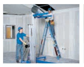
PATENTED TELESCOPING MAST SYSTEM Heavyduty design provides compactness, strength and rigidity.