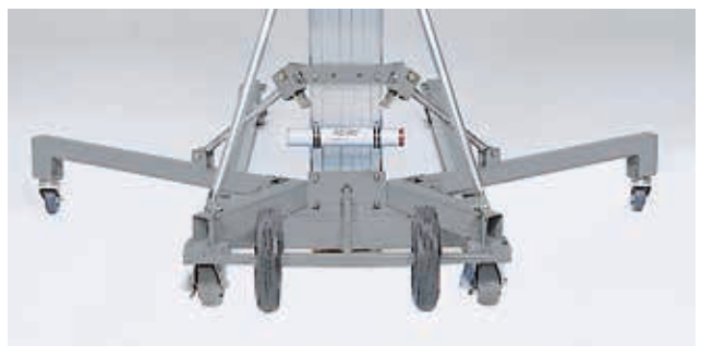
Support for Heavy Loads

The captive stabilizer with patented "locking system" provides additional lateral support for heavy loads (standard on Genie SLC™-18 and SLC-24).