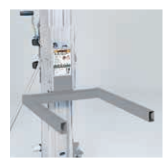
STANDARD FORKS accommodate various loads for versatile lifting. Get an additional 21 in (53 cm) of lift by turning over and re-pinning the forks.

A variety of load handling accessories make this unit extremely versatile.