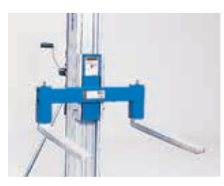
FLAT FORKS, which widen from 16 to 31 in (41 to 79 cm) to provide proper support, allow you to easily lift your load off of flat surfaces.