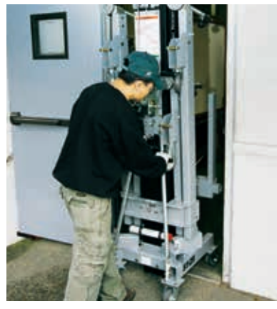
Easy Transport and Storage

The compact stowed position makes the Super Tower lift easy to move through doors and load on trucks with no bulky base to get in the way. Stowed dimensions are 22 in (56 cm) by 25.25 in (64 cm).