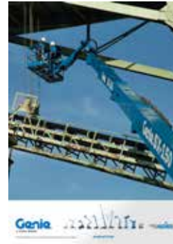
SX-150 Close up