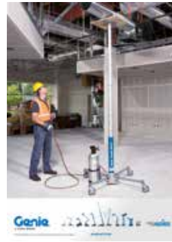
GH™ Super Hoist™