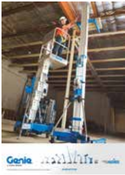
AWP™-30S & SLA™-15