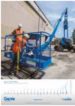
Z-62/40 Fast Mast