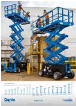
GS-4069RT & GS-3369RT