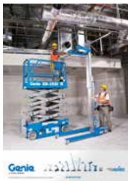
GS™-1930 & SLA-15