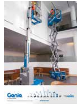
GR™-20 & GS™-1930