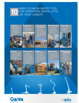
AWP Safety Tips