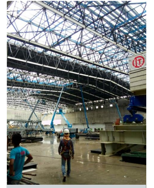
Genie was the only brand to meet the low Occupied Floor Pressure requirements

*Some models may no longer be in production or may have been replaced by newer machines.