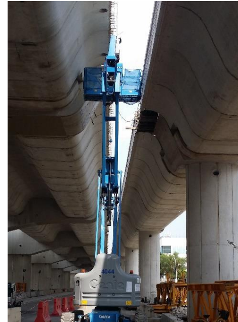
Small footprint with superior lifting versatility in hard-to-reach areas

Genie® S™-105 XC Telescopic Boom Lift Basic Specifications