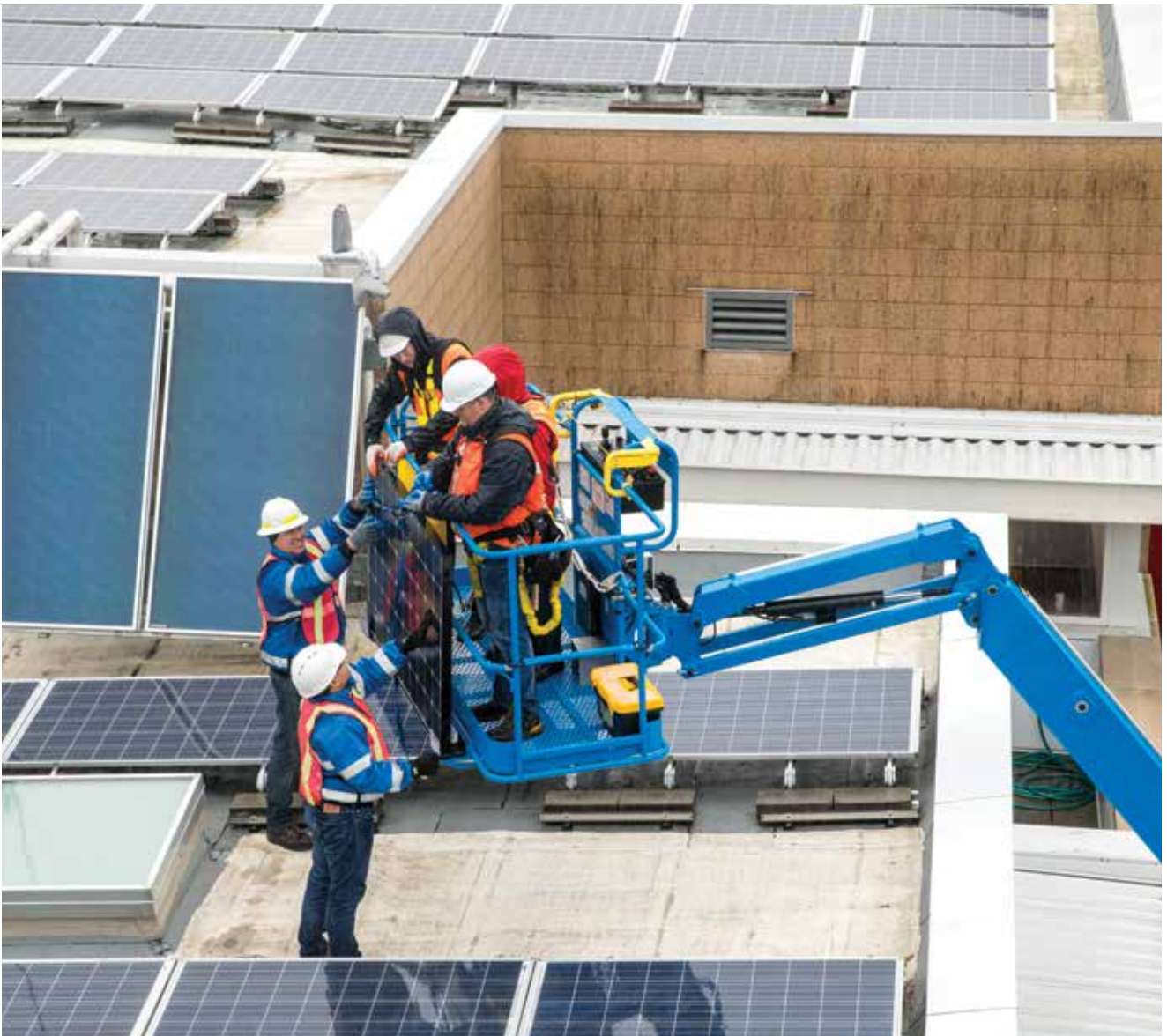
Lift Tools™ Panel Cradle

A variety of accessories are available to help maximize safe productivity while operating Genie® equipment. It pays to understand what's available so you can set yourself apart. In fact, you count on a selection of practical, adaptable accessories because they are critical – sometimes required – on certain jobsites. Consider what Genie has to offer.