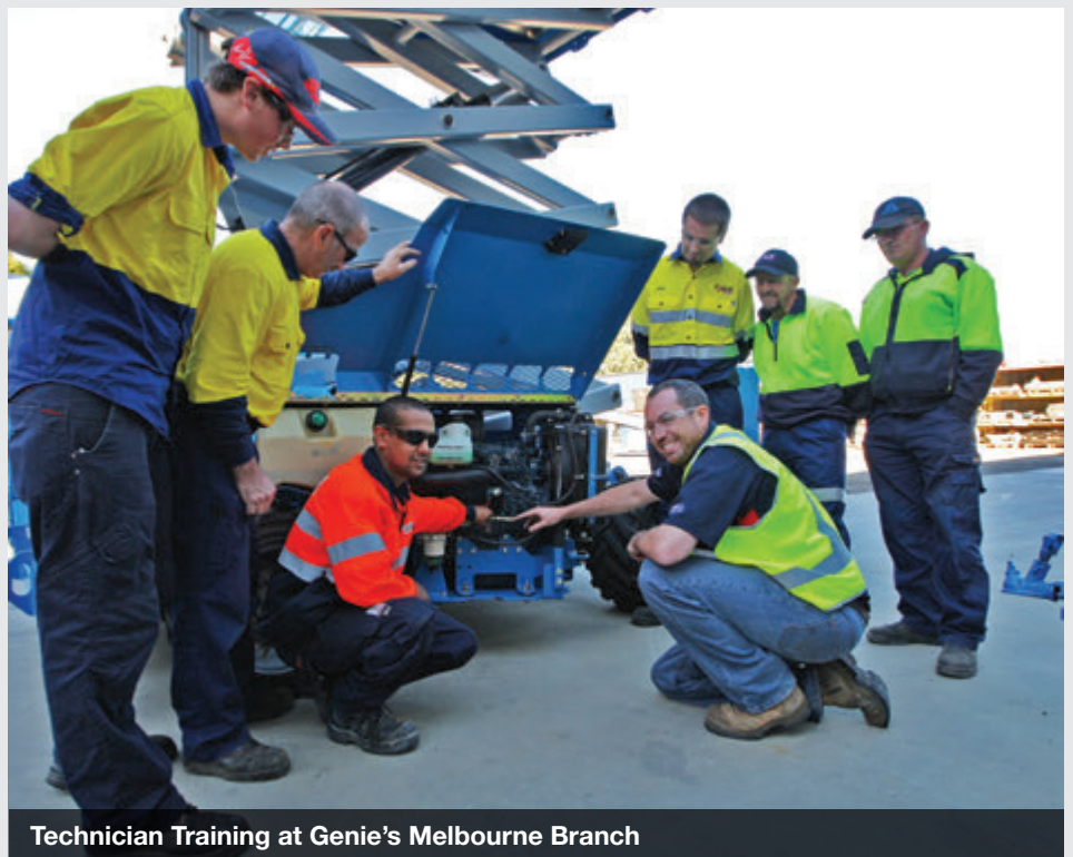
Technician Training at Genie's Melbourne Branch

Designed for newcomers to the industry. Covers the basic requirements of servicing and inspection, terminology, standards, floor loading and risk assessments.