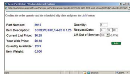
Example parts order confirmation window.

for Genie Industries. "By adding the online ordering function to the system, our goal is to help our customers become more productive with their work by spending less time ordering parts."